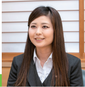
OHMORI CORPORATION Assistant Manager, Engineering Promotion Department

"We can feel confident about maintenance because our contract covers long-term service agreement. The installation of remote monitoring systems enables routine monitoring not only from our headquarters in Noshiro, but also from the branch office in Akita. Even if a problem does occur, the arrangements are in place to ensure it is dealt with promptly."